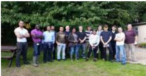
One of many Cummin's teams who helped at our most recent R&M week

CK4 Limited a contractor of Cummins, has supported the Cummins repairs and maintenance work teams with some building activities and providing concrete.