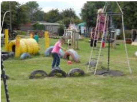
Children play freely enjoying the Adventure Playground

We keep charges as low as possible and try to ensure that lack of money does not prevent children from enjoying our facilities. We are partially grant-aided by Peterborough City Council. We are also supported by grants, fundraising events and appeals. We hope you enjoy reading our Annual report and seeing the photographs and children’s artwork which is scattered throughout these pages.