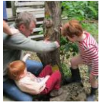
Families enjoying our Saturday Forest School

All the New Ark Playgroup Children in the 'Foundation Stage', come once a week throughout the year to work in the New Ark Garden and Forest. Only when it is very wet or very cold do the children spend long in the Eco Centre building. Most of the time is spent exploring and experimenting in the forest and garden becoming familiar with nature and the passing of the seasons. Identifying the various plants and creatures that live in the garden.