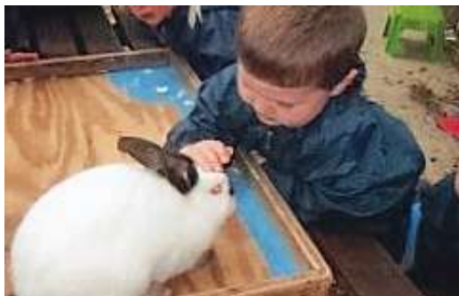
Small animals on New Ark Farm

New Ark is the only City Farm in the Eastern Counties. Children can see, touch and help to care for small pets, poultry and some larger farm animals. They learn about nature and enjoy the responsibility of caring for animals. Many of our animals were rescued from owners who could no longer care for them, and we try to rehome some of them.