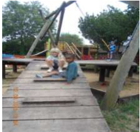
Our playground puts recycled building and industrial materials to good use

We employ professional play and childcare workers, several of whom are Forest School trained. About 100 volunteers help with all kinds of jobs in the adventure playground, eco centre and city farm, plus admin and fundraising.