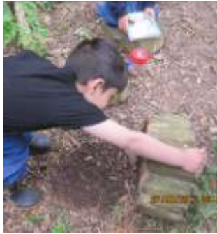
Playgroup children search for bugs in eco sessions