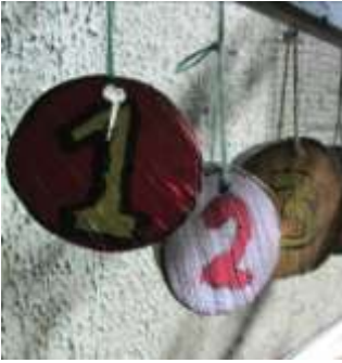
Numbers and letters are hidden in the eco garden