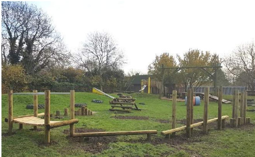
Our brilliant new Trim Trail!