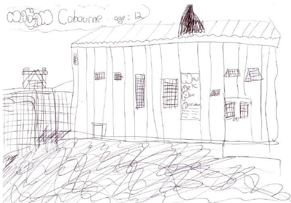
Artwork drawn by Nathan (aged 12 years)

As from October 2016 we have advertised our after school in popular magazine 'Term Times' which reaches households of families all around Peterborough and surrounding areas. We gained interest from children from other schools for our after school service, but we have seen a significant increase in families attending our fund-raising events, so we will be continuing to market through Term Times for our annual events.