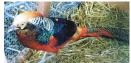
Fez the golden pheasant

We have a number of Rabbits that are in need of a good home if you can help please get in touch with a staff member.