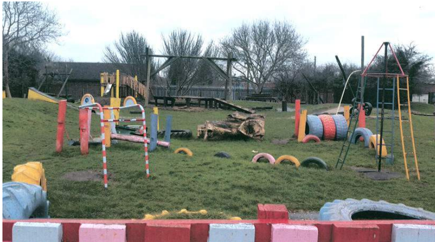
Our playground was becoming old and tired and needed a new face lift to bring us into the 21st century but still keeping that old fashioned Adventure Play!

If you would like to help fund to develop this play area then please speak to a member of staff to make a donation.