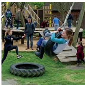
Tyre swing and big slide